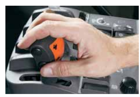
Change speeds with the touch of your thumb with the 16-speed powershift

speeds in the tillage range — from 6.4 to 13.7 kph — with each spaced at half-mile-per-hour intervals. Finding the right speed for the job is easier than ever.